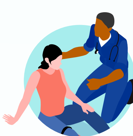
PARAMEDICS & AMBULANCE PERSONNEL