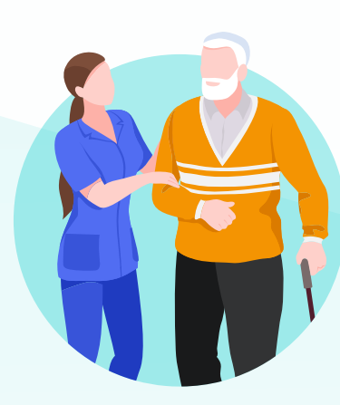
LONG-TERM CARE FACILITIES STAFF