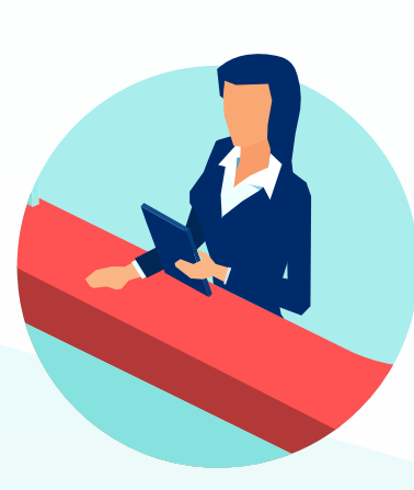
HOSPITAL OR HEALTH FACILITY SUPPORT AND ADMINISTRATIVE STAFF