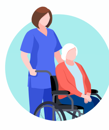
HOME CARE PROVIDERS

Vaccination of healthcare professionals has been demonstrated to reduce death rates by influenza by